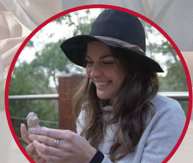
Casey's Skills & Strengths