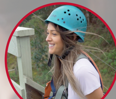
Skye's Skills & Strengths