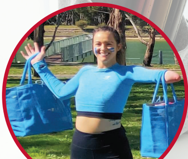
Physical Strength Challenge