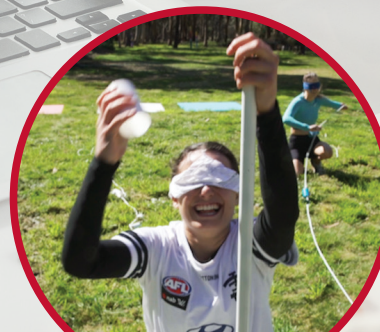
Mental Determination Challenge